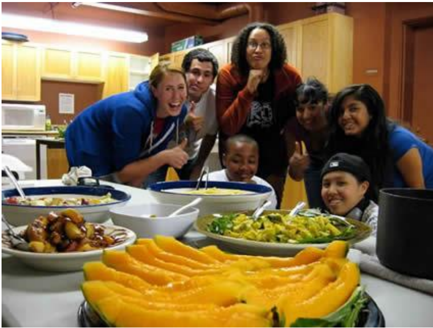
Seattle/King County FEEST