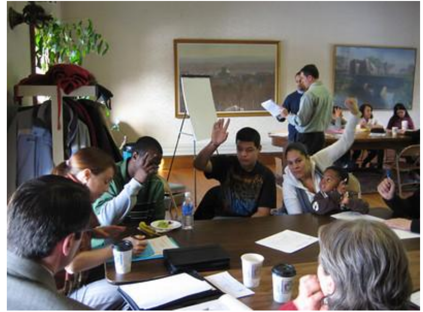
Holyoke Food & Fitness Policy Council